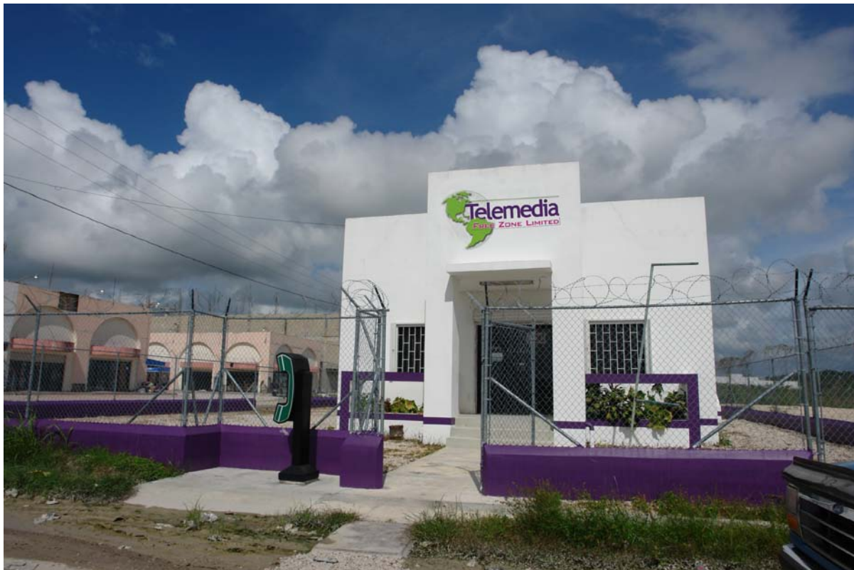
Telemedia's Freezone Office

Appendix 2 to this Offering of Shares summarises the existing litigation concerning Belize Telemedia Limited.