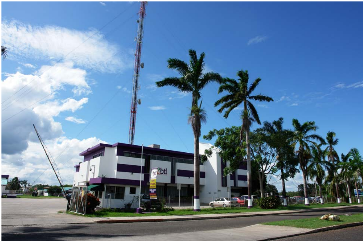
Esquivel Telecom Center, Corporate Headquarters

PKF Belize Chartered Accountants 15 September 2010