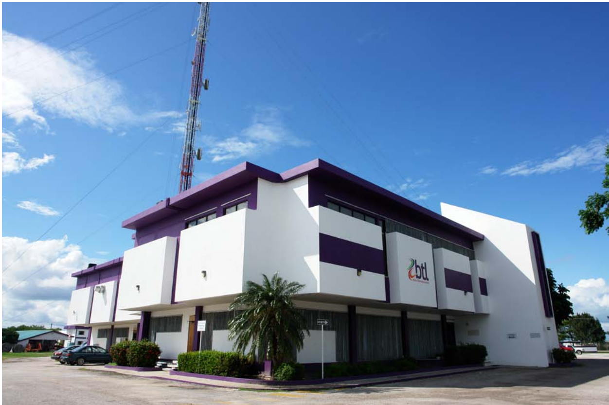
Esquivel Telecom Center – Corporate Headquarters

PKF Belize Chartered Accountants 15 September 2010